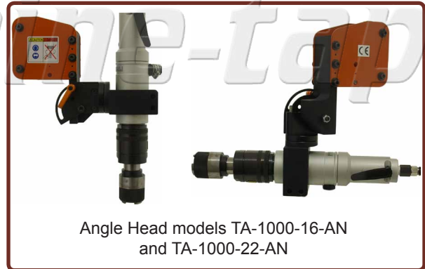
Angle Head models TA-1000-16-AN and TA-1000-22-AN